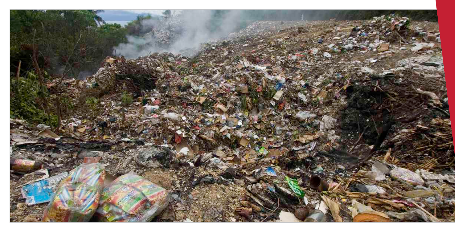
Piles of trash smolder by the side of the road in Central Sulawesi, Indonesia.

Constraints to effective protection of the environment include capacity limitations among government and civil society, poor integration of environmental issues into regional development planning, poor understanding of environmental issues among the general population, and lack of information on biodiversity. CEPF will address these constraints, root causes of biodiversity loss, and direct threats to critical sites in Wallacea.