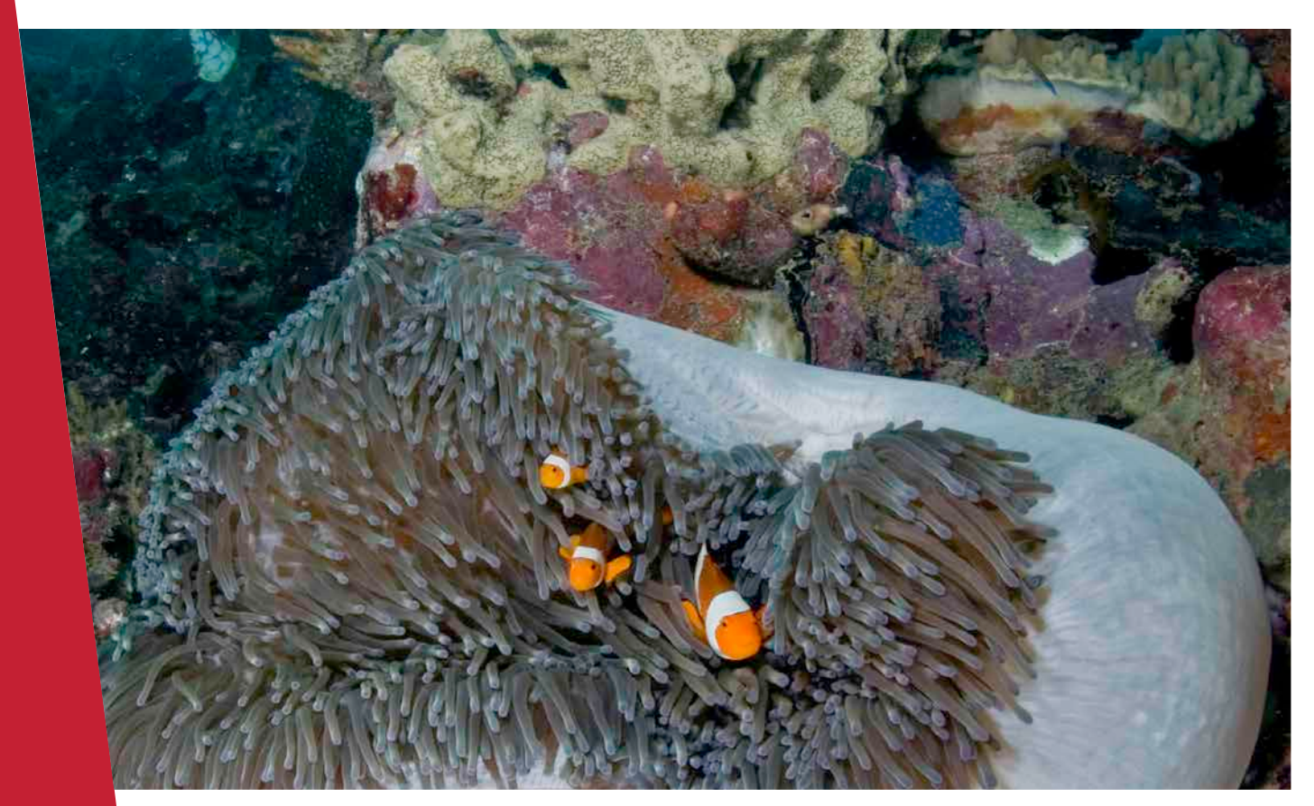
False clown anemonefish ( Amphiprion ocellaris ), Halmahera, North Maluku Province, Indonesia.

In addition, 22 terrestrial species and 23 marine species have been prioritized from among the full list of globally threatened species in the hotspot. The purpose of selecting priority species is to support actions where species conservation cannot adequately be addressed by habitat protection alone. In most cases, the additional action needed is control of overexploitation.