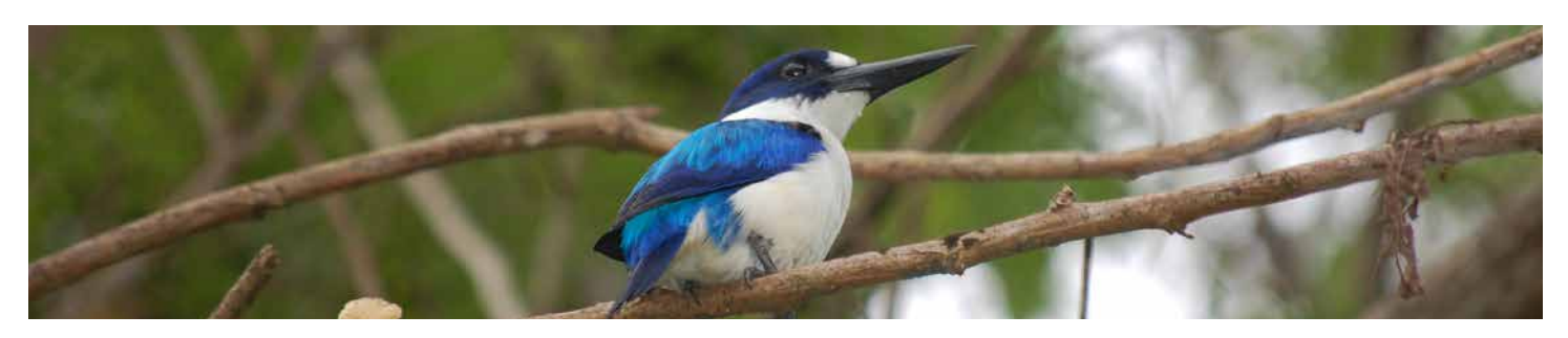
A blue-and-white kingfisher ( Todiramphus diops ), Aketajawe Lolobata National Park, Halmahera, North Maluku Province, Indonesia.