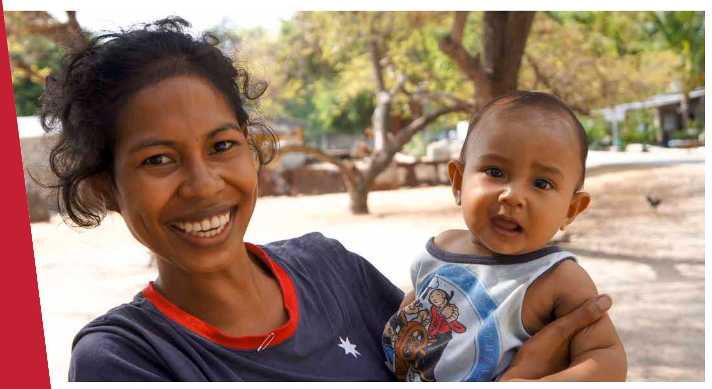
Mother and child, Timor Leste.

In the region overall, marine program funding is concentrated through a coordinated approach by several foundations in the Lesser Sundas and Banda seascapes, and funding for terrestrial programs is focused in parts of Sulawesi. Thus, funding from CEPF is designed to fill a crucial niche for supporting conservation.