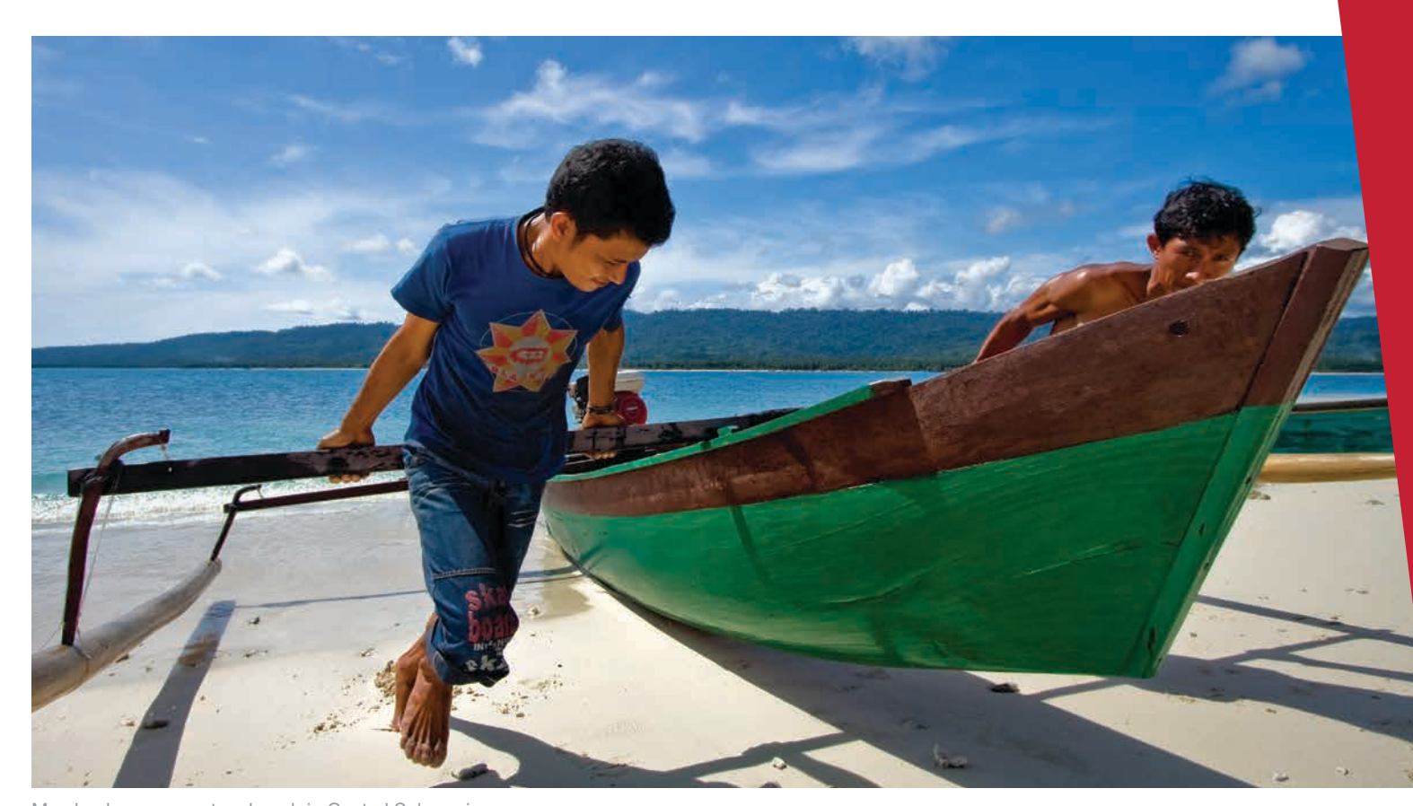
Men haul a canoe onto a beach in Central Sulawesi.

CEPF's investment in Wallacea is guided by an investment strategy, known as an "ecosystem profile." The ecosystem profile presents a situational analysis of the context for biodiversity conservation in the region, framing an investment strategy for CEPF and other funders interested in strengthening and engaging civil society in conservation efforts in the hotspot. In this way, the ecosystem profile offers a blueprint for coordinated conservation efforts in the hotspot and cooperation within the donor community.