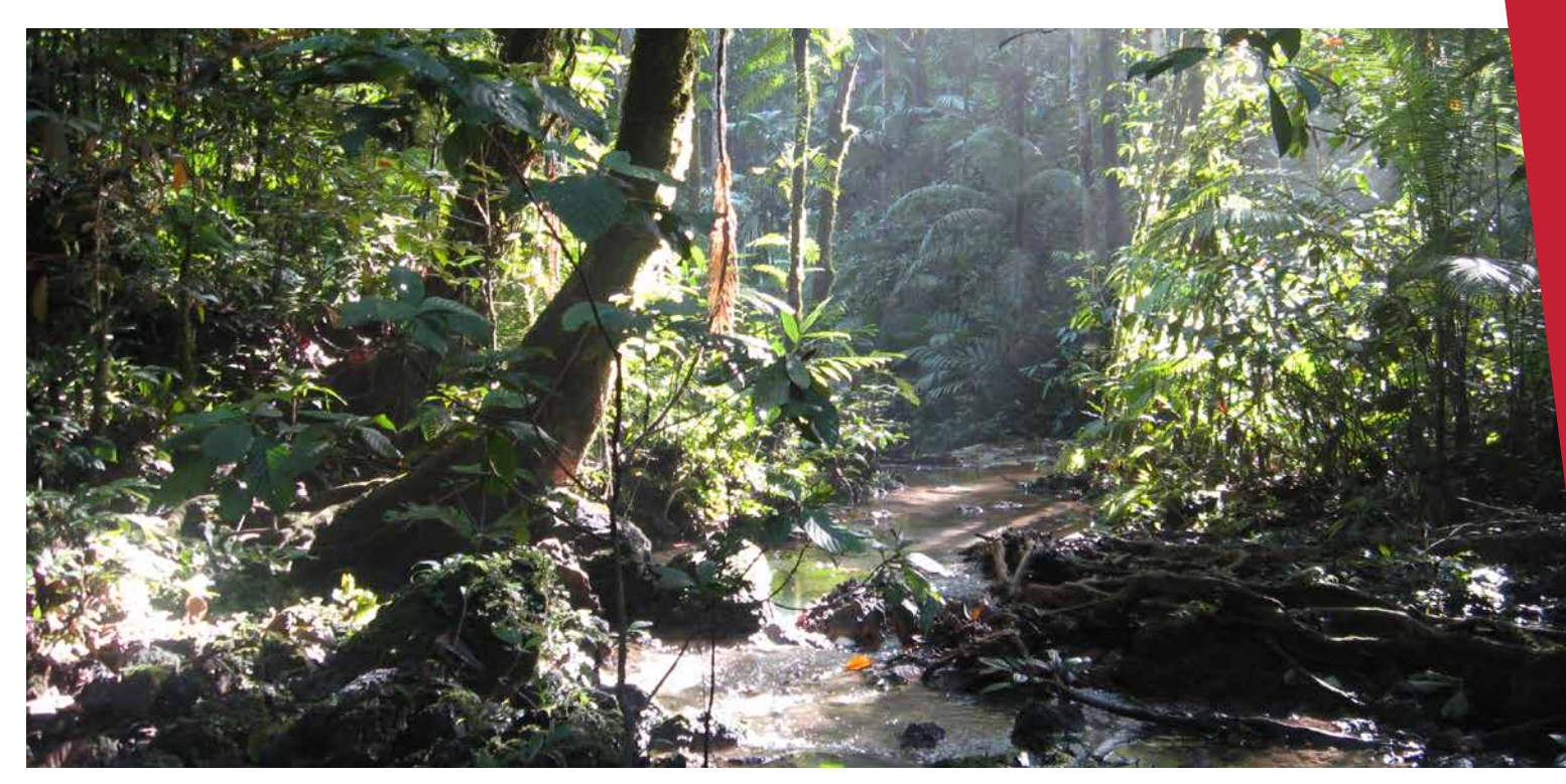
Aketajawe Lolobata National Park, Halmahera, North Maluku Province, Indonesia.

Domestic civil society organizations and local communities have responded to the conservation issues they face with a range of strategies, often founded on traditional customs and governance arrangements. For these groups to be successful, they require greater capacity, as do the groups that give them technical support. Local groups, NGOs and governments also need the ability to monitor and communicate to ensure that they deliver on their overlapping but different goals in relation to the underlying ecosystem. Moreover, there is a need to integrate the goals of conservation areas into plans and policies of other sectors so that they are not undermined by incompatible developments.