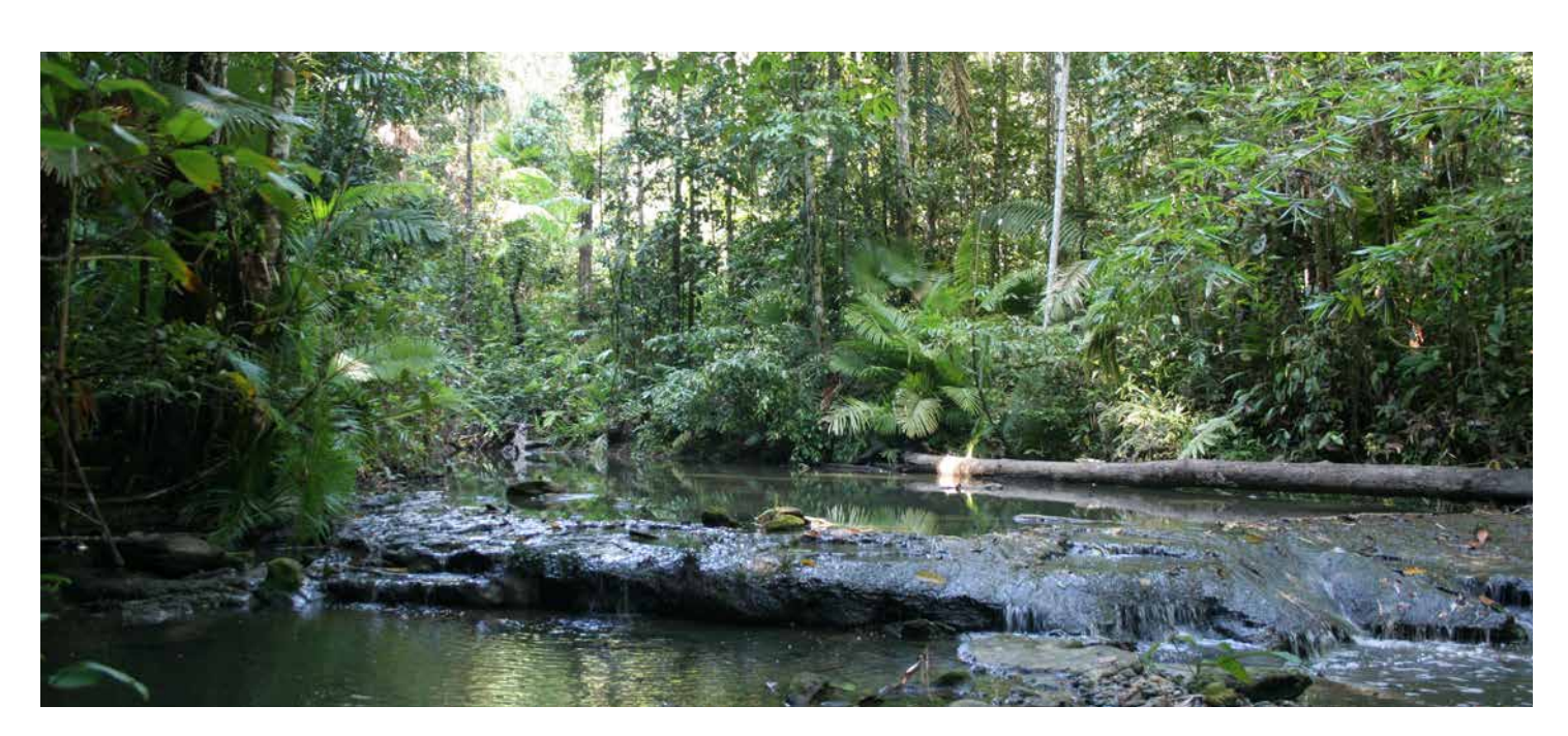
Peda Mangairi River, Halmahera, North Maluku Province, Indonesia.