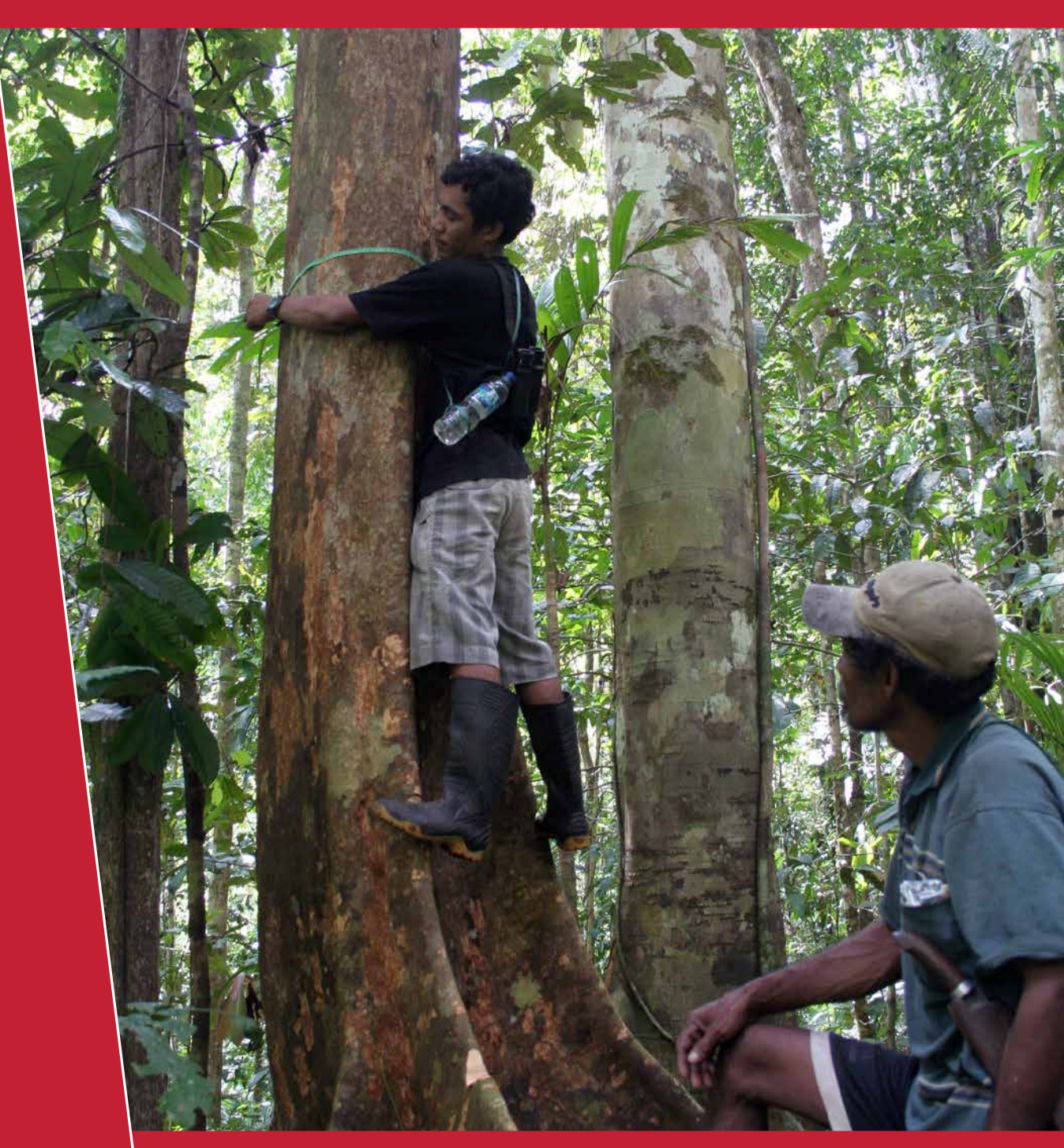
Vegetation survey at Tayawi Forest, Halmahera, North Maluku Province, Indonesia.