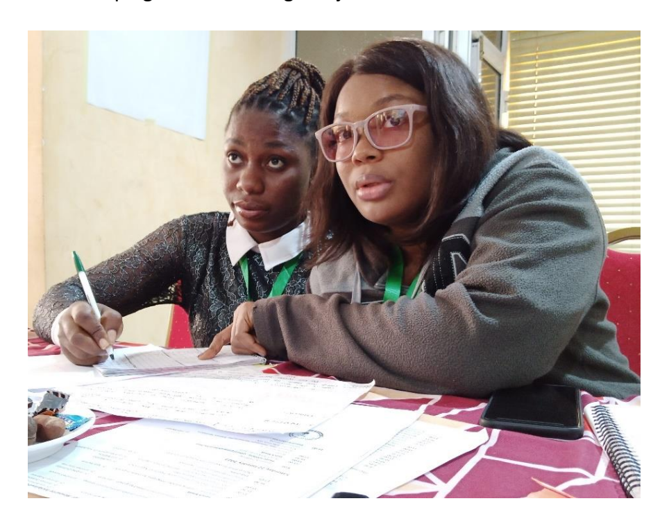
"The course gave me better understanding of conservation project writing including the concepts of long, medium- and short-term impacts"

Civil societies often face challenges in sustaining conservation impacts due to a lack of capacity to leverage resources. Related, is a lack of skills to develop quality projects to match what funders want while keeping to their strategic objectives.